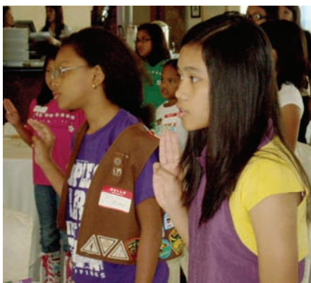
Girls reciting the Girl Scout Promise at the opening of the Take Action training session.